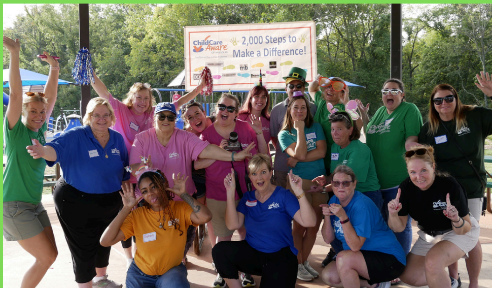
2024 CCAMO and Team Members

Follow us into fiscal year 2024 by signing up for our newsletter, or by following us on Facebook or LinkedIn. If you have interest in joining our board, funding one of our amazing programs, or one of innovative ideas where there is demonstrated need, please email management@mochildcareaware.org .